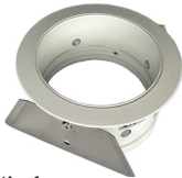
Trim Kit for Existing Ceilings